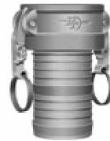
Female Coupler x Hose Shank