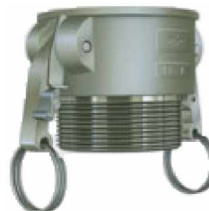
Female Coupler x Male Thread