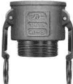
Female Coupler x Male Thread