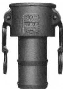
Female Coupler x Hose Shank