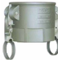
Female Coupler x Female Thread